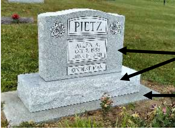
Exhibit B – Monument, Marker, Foundation, and Collar Diagrams

Monument – multi-piece stone used to mark the head of the burial site.